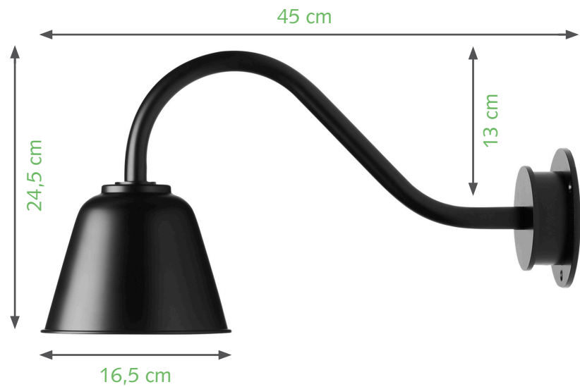
Wall mount base, side