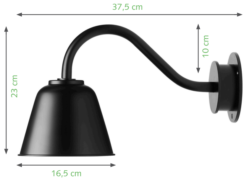
Wall mount base, side