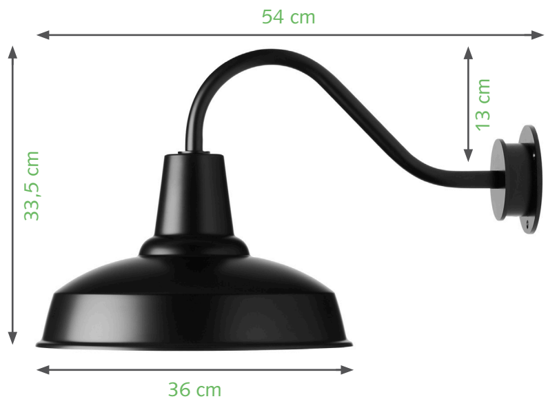
Wall mount base, side